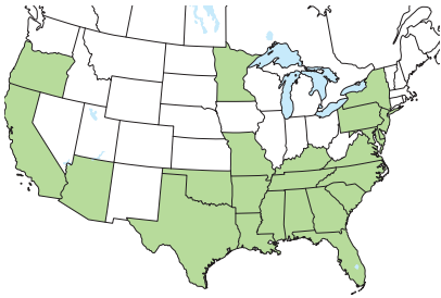
KNOWN LOCATION OF NUTGRASS GROWTH IN UNITED STATES AND CANADA

Nutgrass is a strong weed that can grow underneath vinyl liners. Blast it stops nutgrass from growing through liners. Will not crack, soften or discolor vinyl liners. Do not add to pool water.